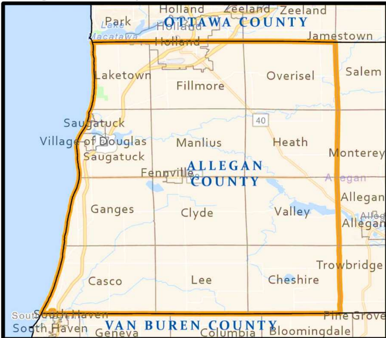
Allegan County Area